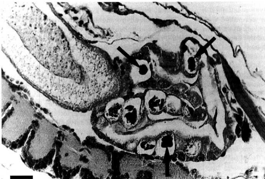
Fig. 2. Penaeus vannamei infected with Vibrio harveyi . Chronically diseased hepatopancreas showing melanised necrotic bundles of tissue. Arrows indicate necrotic aggregates within the hepatopancreas. Scale bar = 0.5 mm

Acknowledgements. Financial support was provided by EU-STD contract number TS3-CT94-0269. We thank D. Garrigues for the supply of larvae.