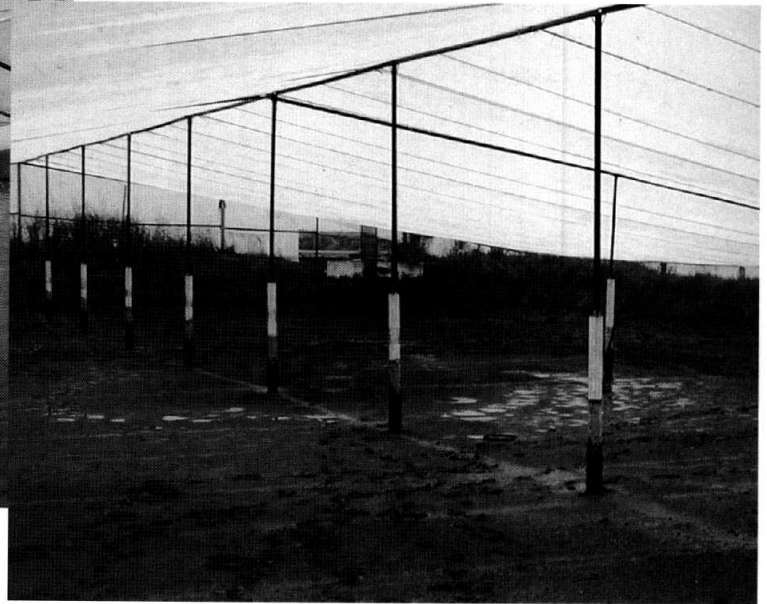
Pond covers built with bamboo poles (left) are functional and initially inexpensive, but may not last as long as covers constructed with more permanent materials.