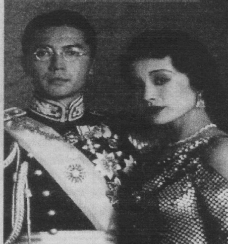
a scene from The Last Emperor